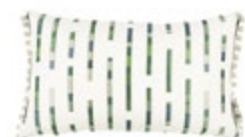
Elwood Eden VNC3557/05 50cm x 30cm / 19.5" x 11.75"