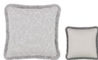
Cerelia Cirrus VNC3559/04 40cm x 40cm / 15.75" x 15.75"