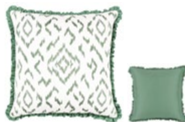
Folly Eden VNC3553/04 55cm x 55cm / 21.75" x 21.75"