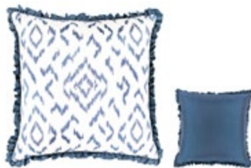
Folly Cornflower VNC3553/02 55cm x 55cm / 21.75" x 21.75"