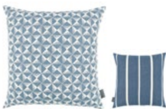
Parterre Cornflower VNC3554/02 50cm x 50cm / 19.5" x 19.5"