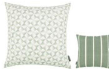
Parterre Spearmint VNC3554/05 50cm x 50cm / 19.5" x 19.5"