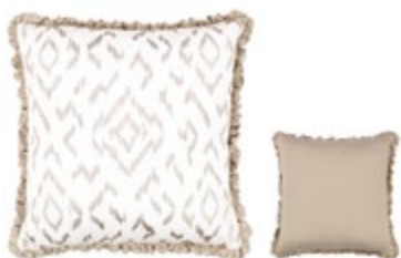
Folly Calico VNC3553/01 55cm x 55cm / 21.75" x 21.75"