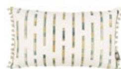
Elwood Meadow VNC3557/03 50cm x 30cm / 19.5" x 11.75"