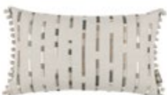
Elwood Birch VNC3557/01 50cm x 30cm / 19.5" x 11.75"