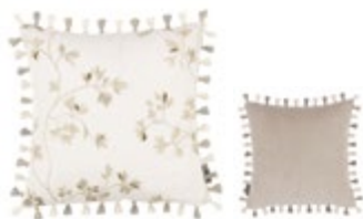
Aurea Calico VNC3556/01 40cm x 40cm / 15.75" x 15.75"