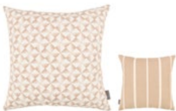
Parterre Blush VNC3554/04 50cm x 50cm / 19.5" x 19.5"