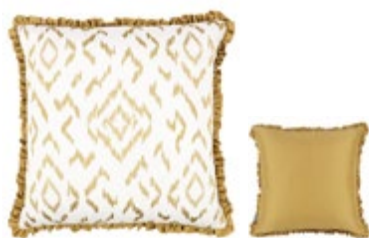
Folly Husk VNC3553/03 55cm x 55cm / 21.75" x 21.75"

Abloom cushions feature elegant embroidered florals and modern patterns, with the exciting addition of ruffles and trimmings.