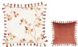
Aurea Saffron VNC3556/04 40cm x 40cm / 15.75" x 15.75"