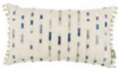
Elwood Cornflower VNC3557/02 50cm x 30cm / 19.5" x 11.75"