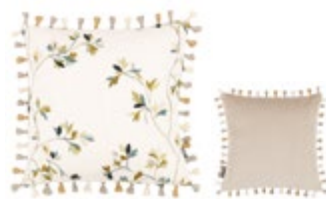
Aurea Meadow VNC3556/03 40cm x 40cm / 15.75" x 15.75"