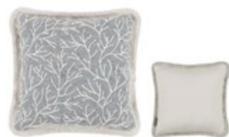
Cerelia Baltic VNC3559/05 40cm x 40cm / 15.75" x 15.75"