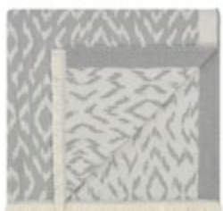
Folly Plume THV3566/01 140cm x 210cm / 55" x 82.75"