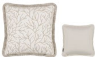
Cerelia Calico VNC3559/02 40cm x 40cm / 15.75" x 15.75"