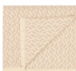
Arden Putty THV3568/01 140cm x 210cm / 55" x 82.75"