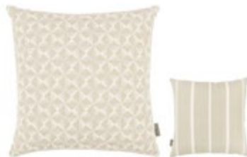
Parterre Birch VNC3554/01 50cm x 50cm / 19.5" x 19.5"