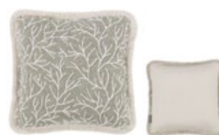
Cerelia Meadow VNC3559/03 40cm x 40cm / 15.75" x 15.75"