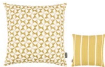
Parterre Husk VNC3554/03 50cm x 50cm / 19.5" x 19.5"