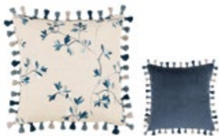
Aurea Cornflower VNC3556/02 40cm x 40cm / 15.75" x 15.75"