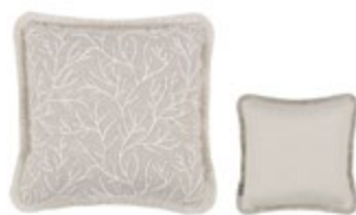
Cerelia Birch VNC3559/01 40cm x 40cm / 15.75" x 15.75"