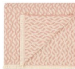
Arden Sundown THV3568/02 140cm x 210cm / 55" x 82.75"