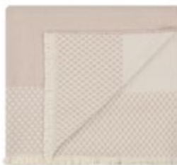
Lea Putty THV3567/01 140cm x 210cm / 55" x 82.75"