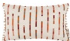
Elwood Saffron VNC3557/04 50cm x 30cm / 19.5" x 11.75"