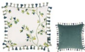
Aurea Eden VNC3556/05 40cm x 40cm / 15.75" x 15.75"