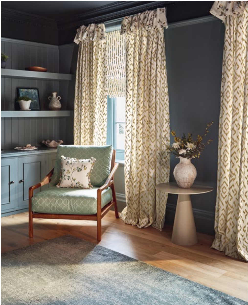
Page 10 – DRAPES: Folly Husk, BLIND: Elwood Meadow, ARMCHAIR: Twyford Marjoram, CUSHION: Aurea Meadow, RUG: Marka Verdigris Page 11 – DRAPES: Fiora Blush, BLIND: Cereia Meadow, THROW: Arden Sundown