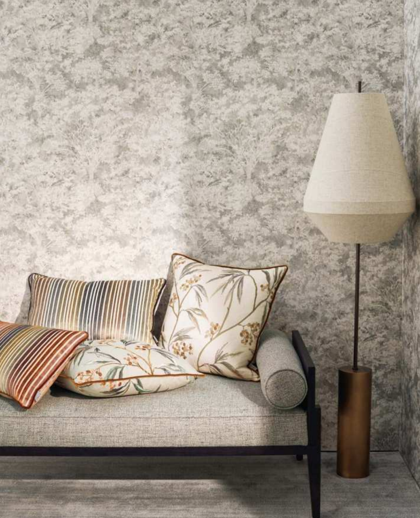
Page 8 - DRAPE: Mima Lovat, WALLCOVERING: Ciro Abaca Hunter Page 9 - CUSHIONS: From the Ottavia Collection, WALLCOVERING: Sikora Lovat