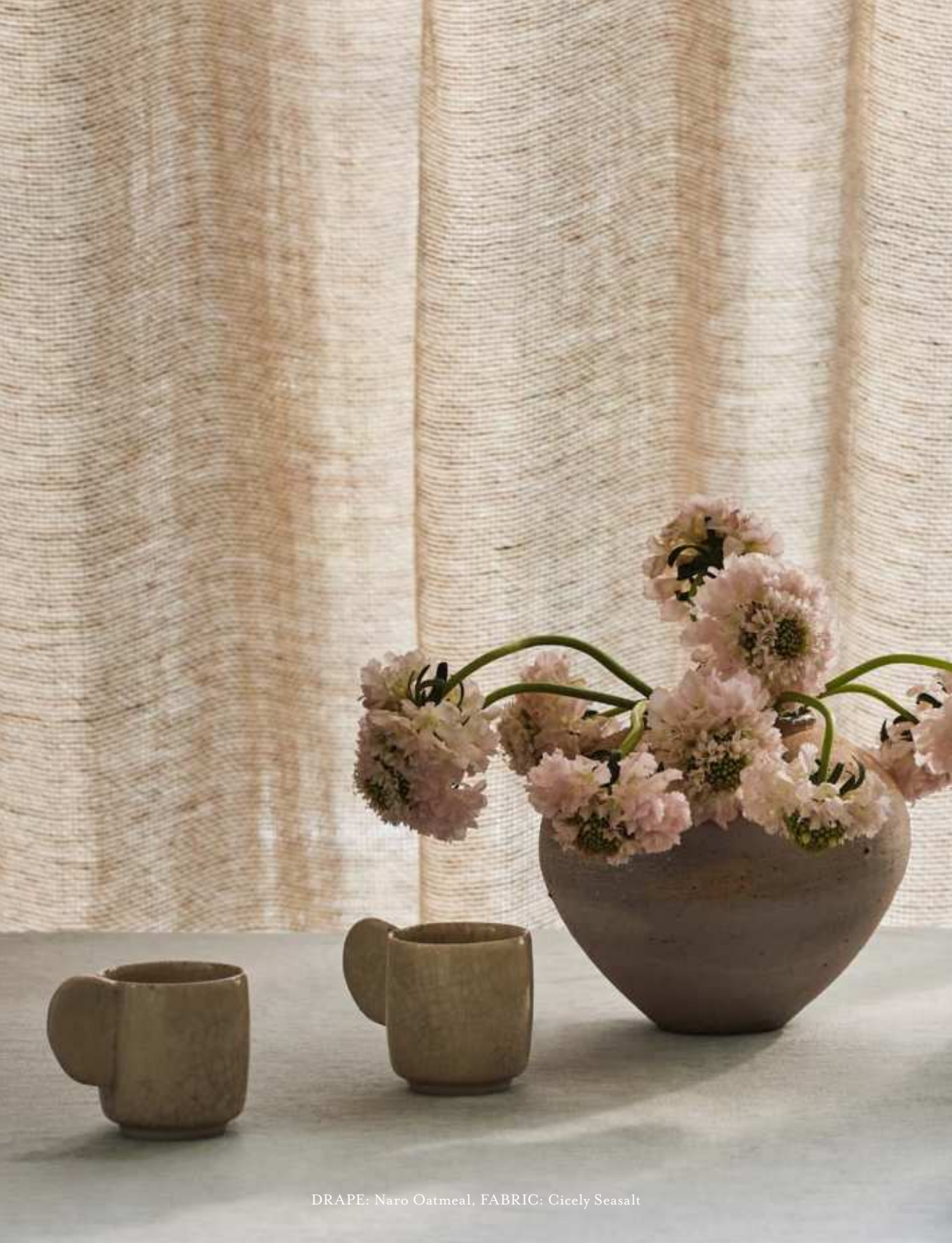
DRAPE: Naro Oatmeal, FABRIC: Cicely Seasalt