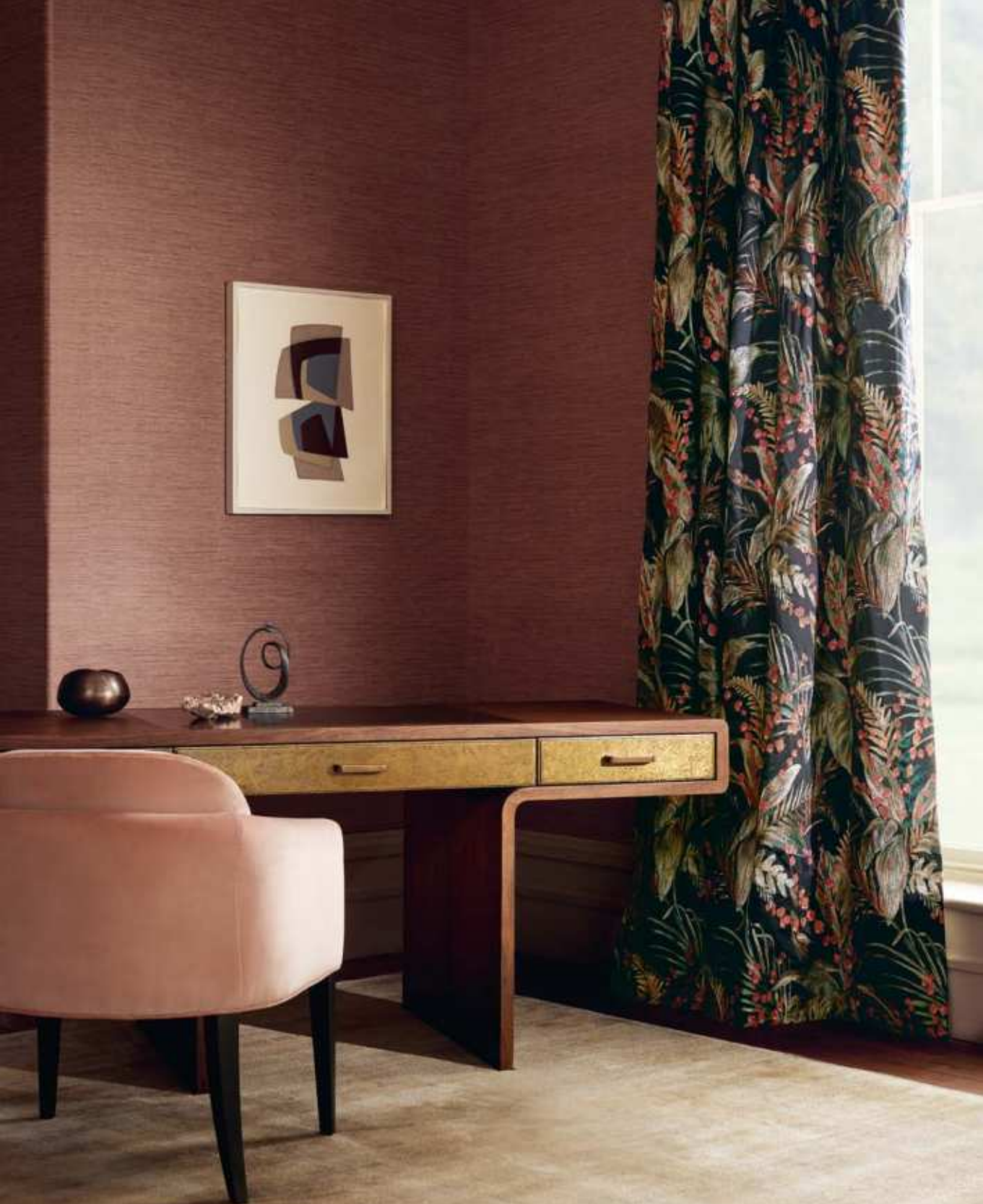
Page 6 - DRAPE: Shiri Copper, CUSHIONS: From the Ottavia Collection Page 7 - WALLCOVERING: Ciro Abaca Russet, DRAPE: Sayula Serandite